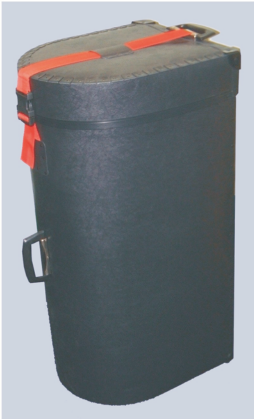
Front view of drum