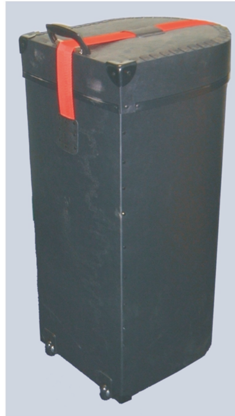
Rear view of drum