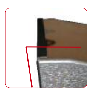
Ensure top of side is aligned/Parallel with front/rear face. Please note: The adhesive dot indicates the top.