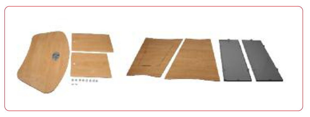
Kit includes: Top, front, back, 2x sides, 2x shelves, 8x turn parts and 2 x hand wheel nuts. Foam tape suppled but not applied (The above kit shown is a deluxe kit)