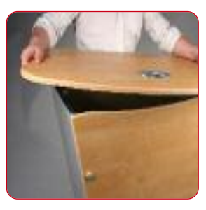
Lift the top onto the base of the unit