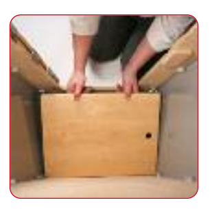
Insert the smaller of the two shelves at the bottom of the unit. Rest the shelf on the shelf locator. Repeat these steps with the upper shelf. Please note: 8 screws are supplied to fix shelves permanently