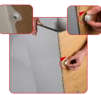
To build the base of the unit align front with the locators on the sides, Screw the turn parts through the front and into the side panel. Repeat this for the remaining sides