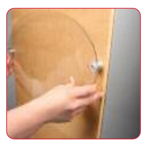
Place the locators of the facia onto the stands off kits