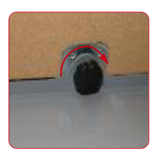
Once the table top is in place secure using hand wheel