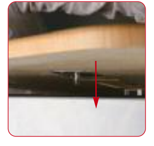
Lower the table top onto the base of the unit. Make sure the table top locators are in the locators on the sides of the unit.