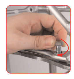
Slot the m8 bolt into the bolt hole