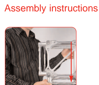
Align the arena section with the bolt holes on both sections