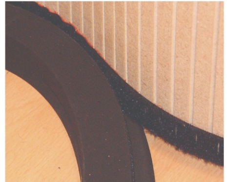
Ensure the hook fastener is fitted securely around the lip of the base and the top